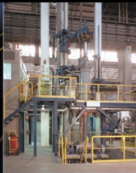
ESR, ELECTRO SLAG REMELTING FURNACE